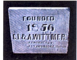
Wittmer Barn Date Stone (note spelling of Wittmer)

A small out building next to the barn needs major repairs to both floor and foundation. Please contact us if you are interested in helping with the repairs and assist us in bringing local agricultural history alive for new generations.